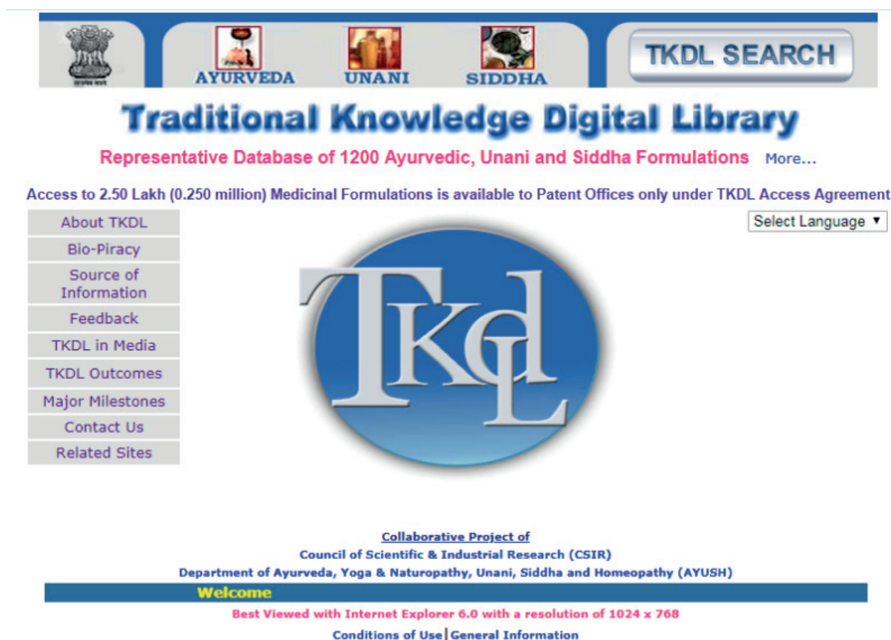
Figure 1: Traditional Knowledge Digital Library (TKDL) website